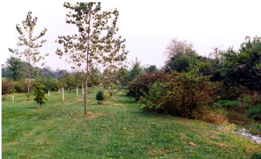
Sample photograph of a three-year-old forest buffer planting.

Forest buffers act as filters of stormwater runoff during storm events. For this reason, forest buffers are especially valuable in urban watersheds when stormwater can be discharged into a buffer rather than discharged directly into a stream. A wide variety of pollutants such as suspended solids (sediment), nutrients (nitrogen and phosphorus), heavy metals, toxic organic pollutants, and petroleum compounds can be successfully filtered and trapped by the physical structure of the vegetation itself and/or in the case of nitrogen and phosphorus, as well as some heavy metals and toxic organics, be taken up through the root systems and stored in the tree and shrub's biomass (wood).