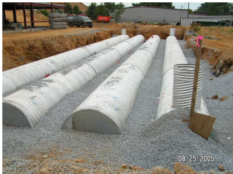
Sample photograph of an underground detention facility

sometimes, persistence. Oftentimes if they are clearly shown what is in it for them and helped to visualize the project's goals through actual examples (photographs) of completed projects, they