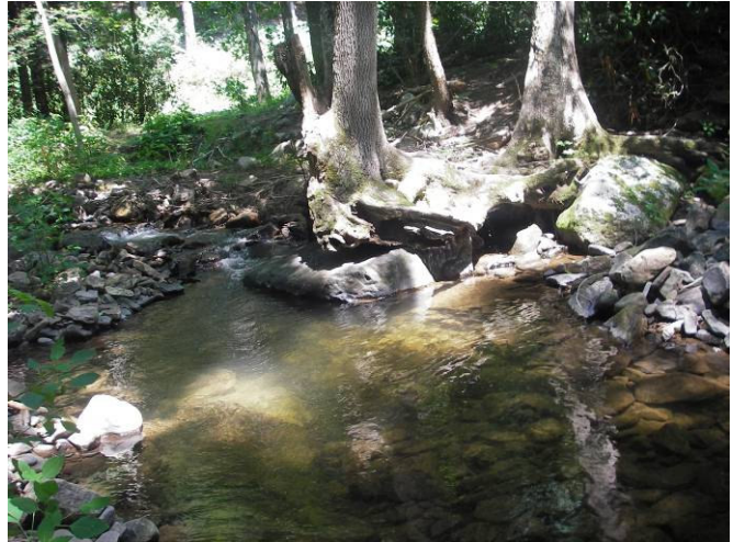
A “fishy” looking spot in “Devil’s Hole”.

Cold Run is approximately 4.8 mile long with an approximately 10 square mile drainage basin located in Blythe, Walker and East Brunswick Townships, Schuylkill County, Pennsylvania. The headwaters of Cold Run originate in a valley between Sharp Mountain and Second Mountain at approximately 1,020 ft. in elevation. The headwaters of Cold Run contain a Class A Wild Brook Trout population and are listed by the Pennsylvania Department of Environmental Protection (DEP) as a High Quality-Cold Water Fishery (HQ-CWF). Land use in this area is a combination of agriculture and single family rural residences on the valley floor with undeveloped woodlots interspersed and on the steeper slopes of Second Mountain and Sharp Mountain. Additionally, a small private dam (Lake Rosemont) is located directly on Cold Run near the most upstream bridge crossing of T-523 (Wnuk and Kaufmann, 1997). As the headwaters meet Beaver Creek, agricultural and development influences on Beaver Creek impact Cold Run. Beaver Creek is the only named tributary to Cold Run, but there are several unnamed tributaries and farm ponds in the basin. The stream turns southward below the confluence with Beaver Creek. This