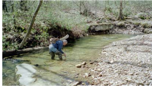
Figure 24. Carl Undercofler sampling water just below SGL #90 bridge.

From the SGL # 90 bridge (Figure 23) to the SGL #90 southern border is some of the prettiest water in the stream. Just below the SGL #90 bridge there is a flat sinuous section with several nice pools (Figure 24).