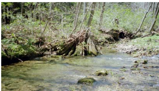
Figure 31. An old hemlock stump is a reminder of the logging era that ended here some one-hundred years ago.

Signs of human disturbance begin to appear not far below the SGL #90 southern border. An ATV trail parallels Lick Run from below the confluence with Stone Run upstream to the SGL #90 southern border (Figure 29). Until a couple of years ago this trail extended upstream all the way to the SGL #90 bridge. Activity appears to have ceased on the SGL #90 section of the ATV trail during the last couple of years. Lick Run is still relatively unaffected by human activity, however, with plenty of good holding water (Figure 30).