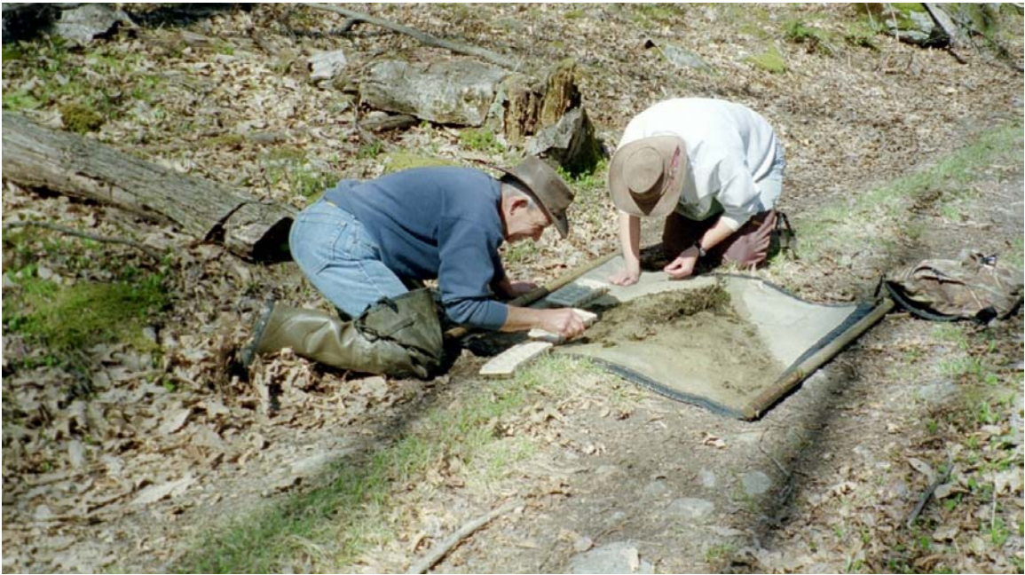
Figure 34. The collected organisms are separated from the debris and placed in trays.