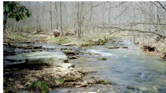
Figure 32. The confluence of Lick Run (center/left) and Stone Run (center/right), mark the downstream extent of the study section.

Here and there an old hemlock stump (Figure 31) still stands as a reminder of the logging era that absolutely devastated the forests of Pennsylvania a hundred years ago.