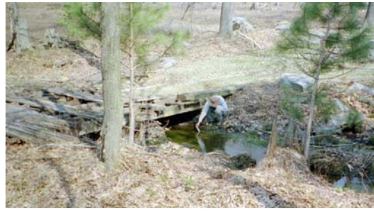
Figure 8. Donna Carnahan sampling water at Panther Rocks site..

A small spring just above Panther Rocks Camp marks the geographical source of the Lick Run main stem (Figure 7). This spring issues from the ground about a half-mile west of the source of Stone Run, the major tributary of Lick Run and lower end of the study section.