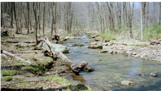
Figure 27. A long flat stretch near the Southern SGL #90 border.

Progressing downstream, the stream gradient increases significantly. The pool at the top of this stretch is perhaps the largest in the assessed section (Figure 25). It marks the beginning of a long, relatively pristine stretch extending all the way downstream to the southern boundary of SGL #90. A quarter-mile long rocky section lies within the middle of this wilderness. Here big boulders form deep pools and the stream is heavily shaded (Figure 26). This section ends about a half-mile above the SGL #90 southern boundary.