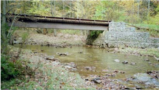
Figure 23. The bridge where the SGL #90 road crosses Lick Run.