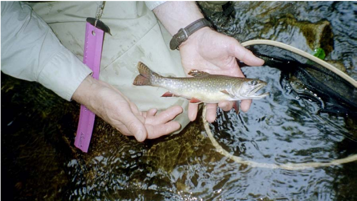
Figure 42. A Lick Run brookie of 243mm (9.6 inches) like this one would be at least 5 and probably 6 or more years old. Growth is slow in these infertile mountain freestones...brookies 9 inches or longer are a rare prize.