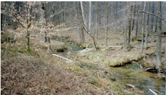
Figure 13. Confluence of Crystal Spring Stream (far left) and Lick Run ( 2 braids on right)

As trees crowd in toward the stream, major pools formed by woody debris appear (Figure 11). About half-way down to Crystal Spring Stream the slope increases and rocks form a series of falls and pools (Figure 12).