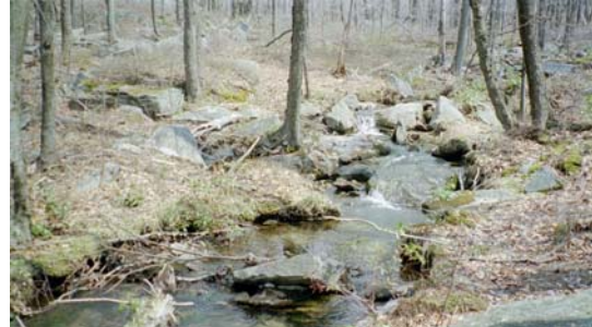
Figure 12. As slope increases, large rocks create waterfalls and plunge pools.

As trees crowd in toward the stream, major pools formed by woody debris appear (Figure 11). About half-way down to Crystal Spring Stream the slope increases and rocks form a series of falls and pools (Figure 12).