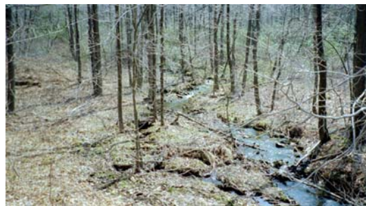
Figure 10. Farther downstream the forest begins to close in.

As one progresses downstream stream, flow increases rapidly and significant pools begin to appear. A small tributary enters from the east and adds considerable flow to the main stem. The riparian area for the first half-mile below Panther Rocks Camp is very open (Figure 9). There is almost no shading of the stream in this section. A lot of boggy sphagnum seeps on either side of the stream add to the flow. A little farther downstream the riparian border becomes tree-covered (Figure 10).