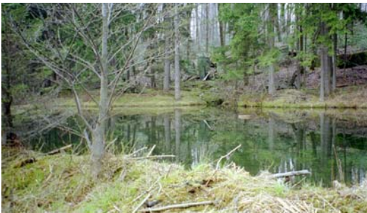
Figure 4. The old pond is now occupied by beavers. Crystal Spring is visible just above the center of the photo.

Crystal Spring Stream, begins in a broad open area (Figure 2) north of Crystal Spring Road. It flows under Crystal Spring Road and down past the ruins of the Crystal Spring Lodge. Crystal Spring still flows strong and the ruins of the old spring house are still visible (Figure3).