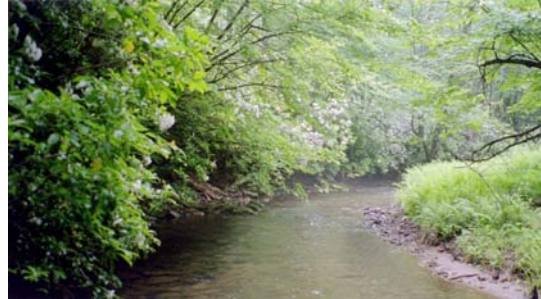
Figure 22. Overhanging rhododendron provides shade and cover in the summer and a beautiful setting in early-July.

cover for brookies in this section (Figure 21). New pools were formed by woody debris and rock bars were piled up by the massive flooding. Rhododendron along the banks helps to shade the stream during the summer and provides cover (Figure 22) in some places.