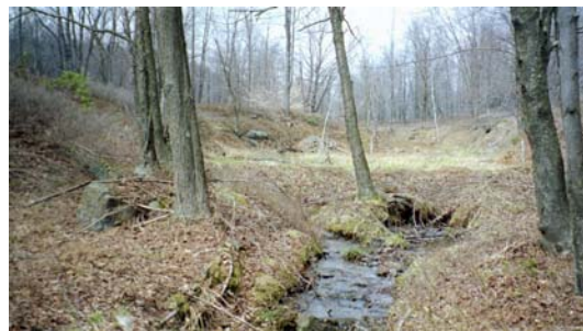
Figure 14. Remains of an old splash dam. Lick Run flows behind bank on left.

A small tributary enters the main stem about a quarter-mile above the confluence of Lick Run and Crystal Spring Stream. Below the confluence of Lick Run and Crystal Spring Stream (Figure 13) flow is about doubled by the inflow from these two tributaries.