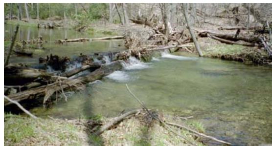
Figure 28. Large woody debris forms a nice pool above and plunge pool below.