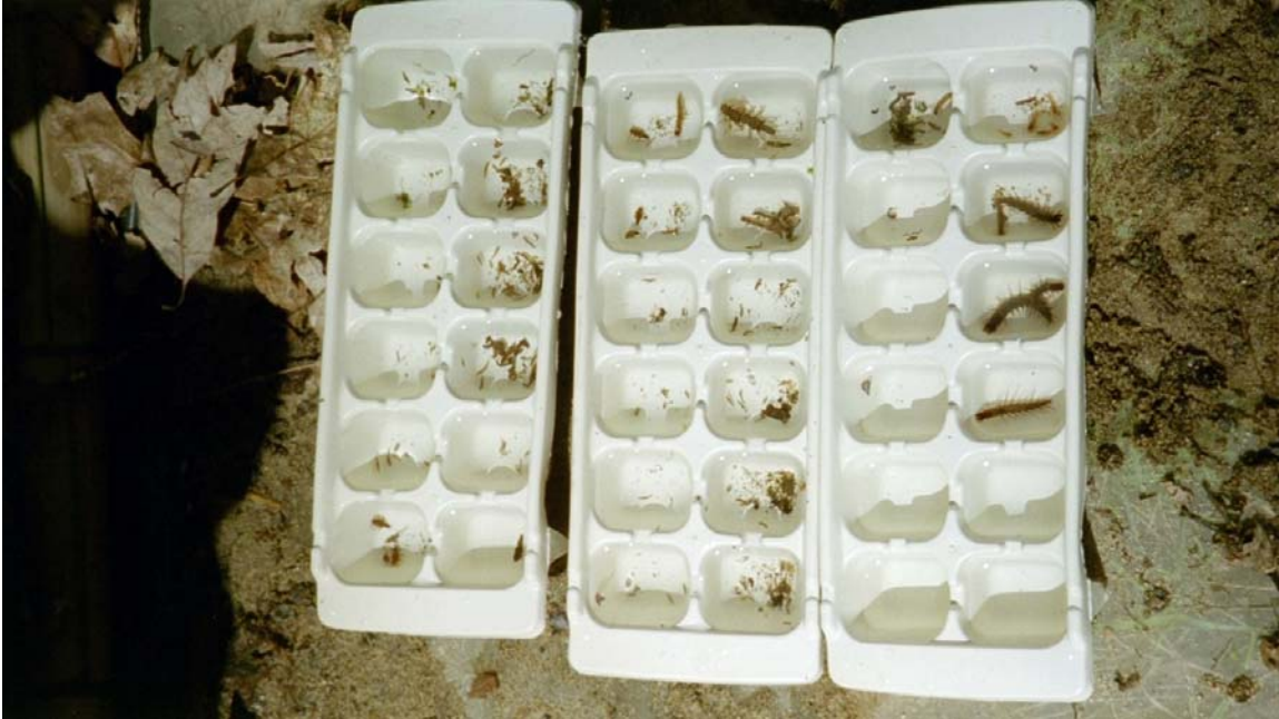
Figure 35. Trays of collected benthic invertebrates ready for species identification and counting.

Hurricane Ivan had been through the area about three weeks before the fall survey was conducted. Its effects were obvious. Stream level had been two to three feet above normal. Massive movement of the streambed was evident. Trees and rocks had been washed downstream and deposited forming large bars and deep pools. In places banks and tree roots were undercut and uprooted forming excellent habitat for brook trout. By the time of the survey, Lick Run and its tributaries were back to base flow.