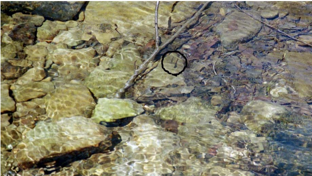
Figure 38. A newly-hatched brook trout (circled). The hatchling brookie is on the left and his slightly larger shadow to the right. The edges of the stream and small braids were full of these newly hatched brookies during the spring of 2005.