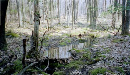
Figure 7. The source of Lick Run. A small spring just above Panther Rocks camp