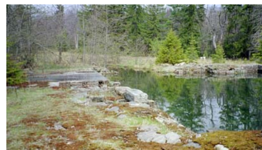
Figure 5. All that remains of Crystal Spring Lodge is the water-filled foundation.

The outflow from Crystal Spring enters an old beaver dam (Figure 4) where a pond in front of the lodge once held trout for use in the restaurant. The area is now an open wetland. All that remains of the lodge is the cellar and foundation which are now filled with water (Figure 5).