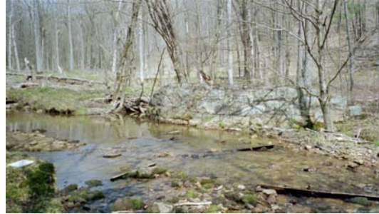
Figure 20. Abutment was to have been where Kennedy Road crossed Lick Run.

There is a recently abandoned beaver dam at the confluence of Lick Run and Doctors Fork (Figure 19). Except for the mid-winter survey, brook trout of several age classes were observed all through this area every time it was visited.