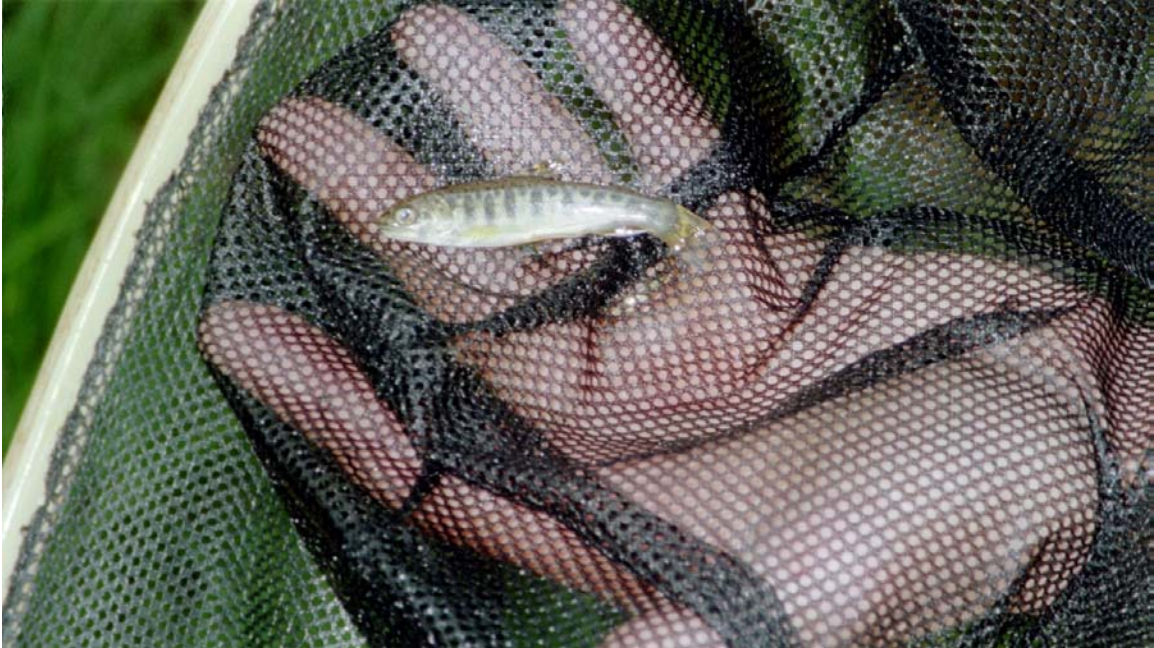
Figure 39. A Lick Run brookie in early August of the first year of life is about 66mm (2.6 inches) long. They grow fast at this age, but few survive the first year of life.