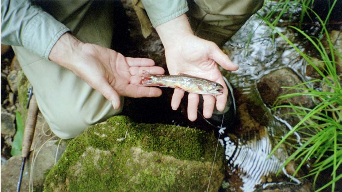
Figure 41. By the fourth summer of life Lick Run brookies have grown to about 170mm (6.7 inches) like this one. Some brookies this old might be of legal size (7 inches).