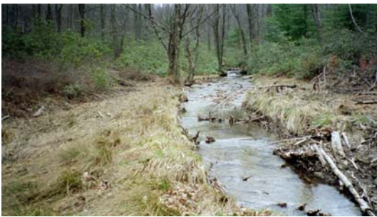
Figure 17. Doctors Fork looking upstream from LickRun, Note how the grass is flattened from high water flows.

Brook trout begin to appear at the confluence of Lick Run and Doctors Fork. There is a broad basin at the confluence of the two streams and an abundance of springs and seeps. Apparently, they add just enough buffering to Lick Run so that brook trout can survive and reproduce from here downstream. From here to Stone Run, Lick Run is a beautiful wilderness stream with riffles and pools, magnificent scenery and enough brook trout to make fishing it a pleasurable way to spend the day.