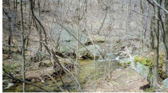
Figure 16. Big rocks and pool about a half-mile above Doctors Fork.

The stream morphology from Crystal Spring Stream to Doctors Fork is mostly one of riffles and pools formed by large woody debris and large rocks (Figures 15 & 16). The quarter-mile section above Doctors Fork is flat and featureless, with shallow riffles and poor habitat.