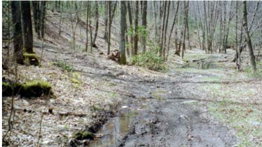
Figure 29. An ATV trail (on private land) turns uphill to left. SGL #90 southern boundary is just beyond view at top right.