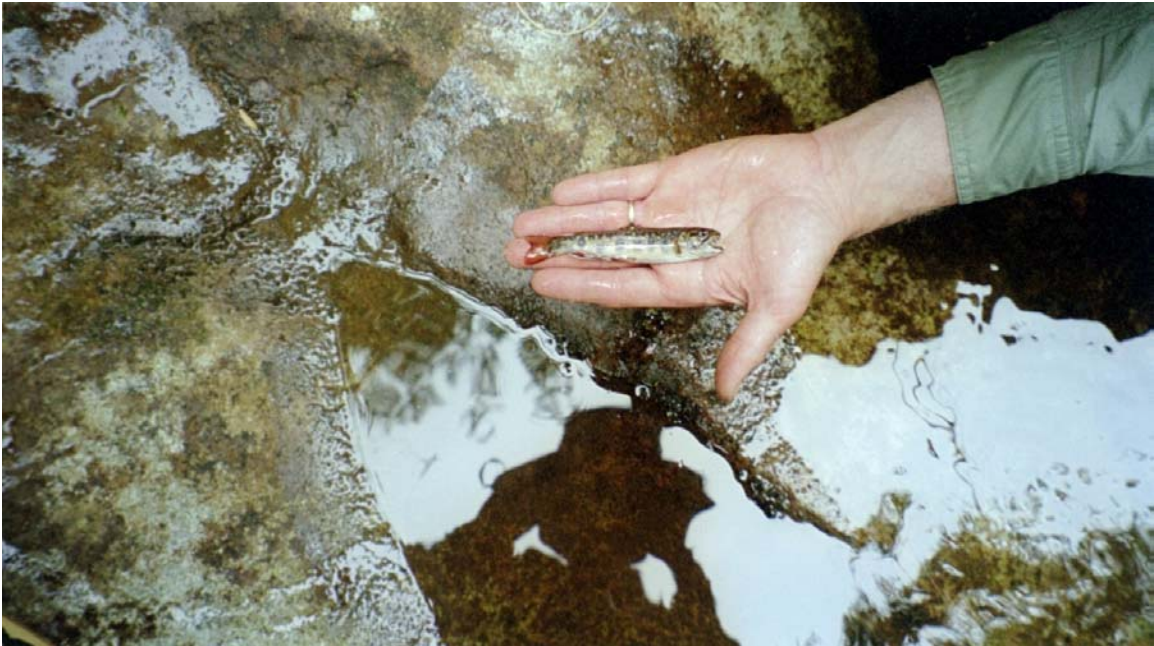
Figure 40. By the third summer of its life a Lick Run brookie would be about 144mm (5.7 inches long).