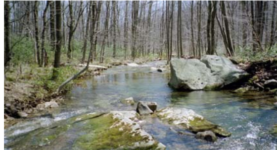
Figure 30. A large pool not far below the the SGL # 90 southern boundary

Lick Run is still relatively wild through the mile-long privately-owned section from SGL #90 to the Stone Run confluence. It has some nice pools and plenty of good habitat.