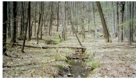
Figure 18. Tiny tributary flowing into Dr. Fork at the confluence with Lick Run. It has elevated pH and holds lots of brook trout.

Doctors Fork is a major tributary entering from the west (Figure 17). There is an interesting little tributary (Figure 18) that enters Doctors Fork at the confluence with Lick Run. It originates about a half mile above Doctors Fork at the base of the mountain that divides Doctors Fork and Lick Run. It maintains its flow throughout the year, has a pH averaging about 5.8 and it is full of brook trout. Brook trout were seen spawning here in the fall of 2004.