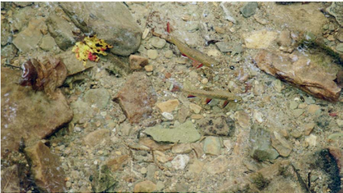
Figure 36. Brook trout on the redd. The male is the larger fish visible in the upper center above the smaller female. Both are hovering over a nearly finished redd that the female is in the process of completing in preparation to spawning.

It was obvious the following spring that brook trout in Lick Run had successfully reproduced during the fall and winter of 2004/2005. Many newly-hatched brook trout were visible in the shallows along the edges of the main stem and in small stream braids the spring of 2005 (Figure 38). Young-of-the-year brook trout were present from the confluence of Stone Run to Doctors Fork throughout the spring and summer of 2005. No young of the year brook trout were observed above Doctors Fork or in Doctors Fork. Adult brook trout were seen in Doctors Fork.