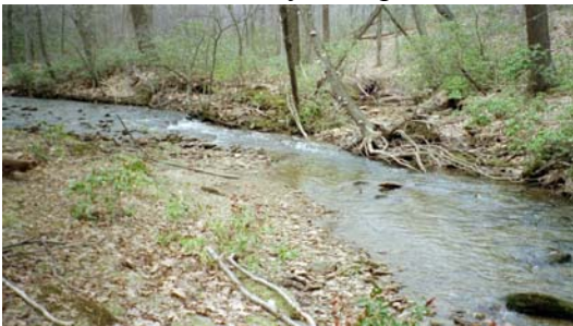
Figure 21. Undercut tree roots form a glide-pool between Doctors Fork and the SGL #90 bridge.

From Doctors Fork to the SGL #90 bridge, Lick Run has a shallow gradient. Hurricane Ivan carved out many nice pools, undercut tree roots and the bank, forming excellent