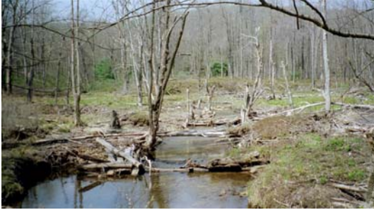
Figure 19. Abandoned beaver dam at confluence of Doctors Fork and Lick Run.