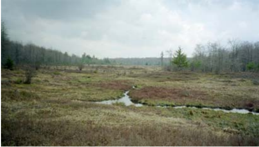
Figure 2. Headwaters of Crystal Spring stream.