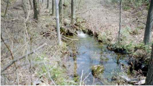
Figure 11. As the trees crowd in, woody debris forms pools.