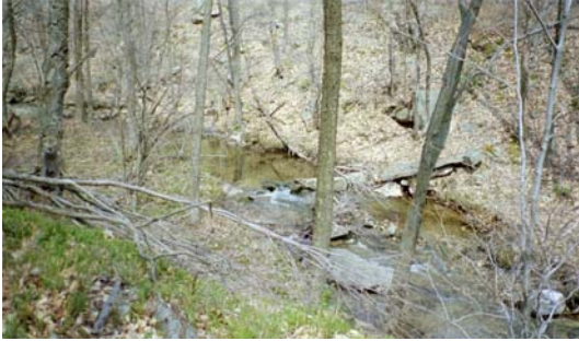
Figure 15. Typical pool and riffles series between Crystal Spring stream & Dr. Fork