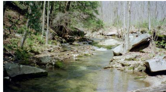
Figure 26. Lower end of a long, boulder-strewn stretch with deep step pools on SGL #90.

Progressing downstream, the stream gradient increases significantly. The pool at the top of this stretch is perhaps the largest in the assessed section (Figure 25). It marks the beginning of a long, relatively pristine stretch extending all the way downstream to the southern boundary of SGL #90. A quarter-mile long rocky section lies within the middle of this wilderness. Here big boulders form deep pools and the stream is heavily shaded (Figure 26). This section ends about a half-mile above the SGL #90 southern boundary.