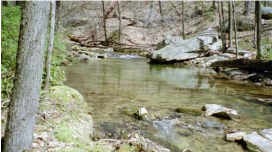
Figure 25. Very large pool below SGL #90 bridge marks the beginning of a high-gradient stretch of Lick Run.

From the SGL # 90 bridge (Figure 23) to the SGL #90 southern border is some of the prettiest water in the stream. Just below the SGL #90 bridge there is a flat sinuous section with several nice pools (Figure 24).