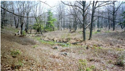
Figure 9. Looking upstream toward Panther Rocks Camp.

An old bridge below the Panther Rocks Camp (Figure 8) was the uppermost site where Lick Run main stem measurements were taken. The stream is very small in this area and nearly dries up most summers. Little life was observed here, neither during the stream walk nor during the fall 2004 and spring 2005 benthic invertebrate surveys.