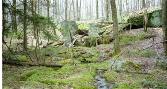
Figure 3. Ruins of Crystal Spring (upper center) and outflow (lower center/right)

Crystal Spring Stream, begins in a broad open area (Figure 2) north of Crystal Spring Road. It flows under Crystal Spring Road and down past the ruins of the Crystal Spring Lodge. Crystal Spring still flows strong and the ruins of the old spring house are still visible (Figure3).