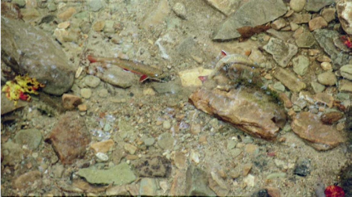
Figure 37. The female (center/right) rapidly undulates her body in order to sweep the redd clear of silt and other debris before depositing her eggs. The male waits behind until the redd is ready.