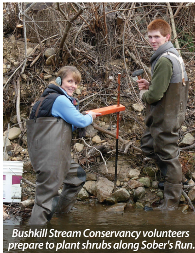
Bushkill Stream Conservancy volunteers prepare to plant shrubs along Sober's Run.

Riparian buffers have been lost in many places in the Bushkill Creek Watershed over the years. Preserving existing buffers and restoring lost ones are important steps forward for water quality, stream bank stability, flood protection, and fish and wildlife habitat. Landowners, farmers, governments, businesses and conservation organizations can all work together to help restore and protect riparian buffers, which in turn restore and protect the quality of our streams and drinking water.